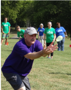
Oasis Field Day.