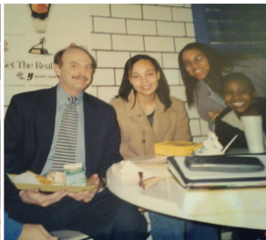
Principal at Hume-Fogg Magnet High School.