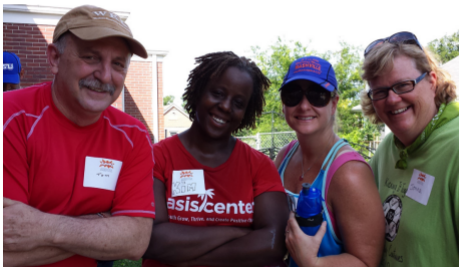
Oasis volunteering in the community.