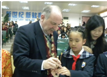
Vanderbilt Principals Leadership Academy, Guangzhou, China.