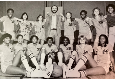
Teacher and Girls' Basketball Coach at Cameron Middle School.