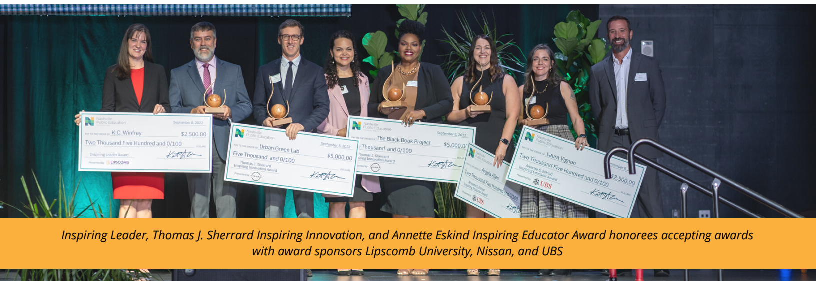
Inspiring Leader, Thomas J. Sherrard Inspiring Innovation, and Annette Eskind Inspiring Educator Award honorees accepting awards with award sponsors Lipscomb University, Nissan, and UBS